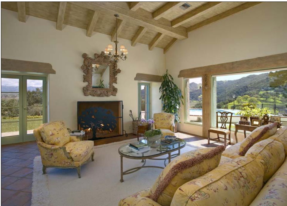
Living Room of Main Residence