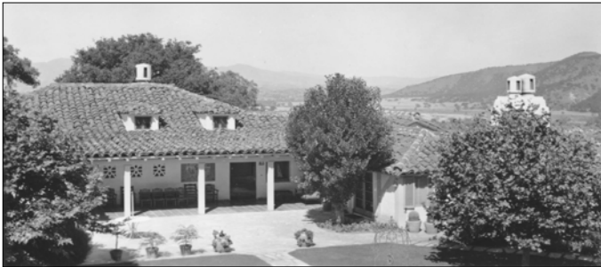
Main Residence Circa Late 1930s