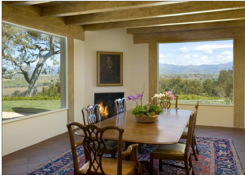
Dining Room of Main Residence