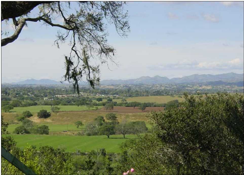
View from Property