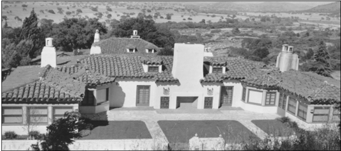
Guest Quarters Courtyard and View Circa Late 1930s