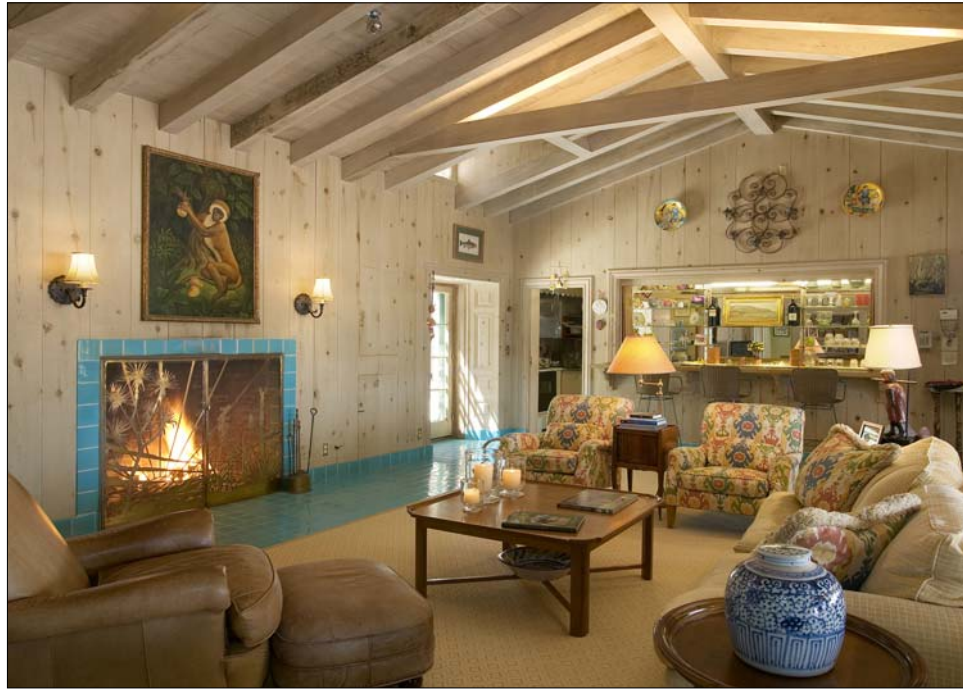
Great Room of Guest Quarters