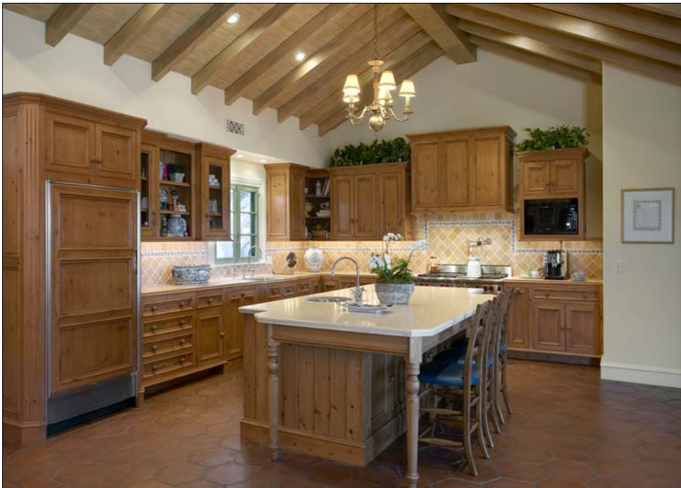
Kitchen of Main Residence