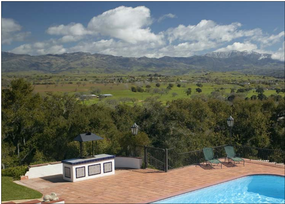
View from Pool