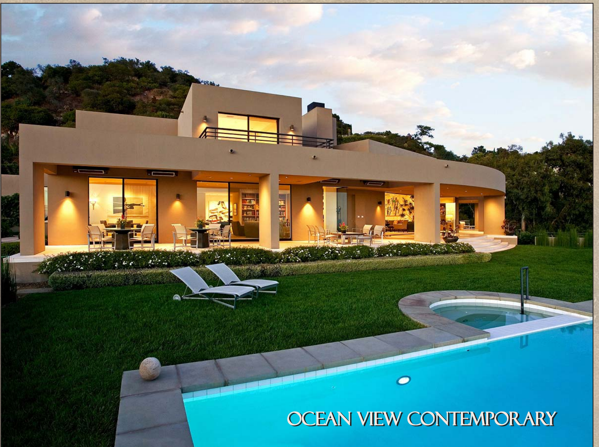
OCEAN VIEW CONTEMPORARY