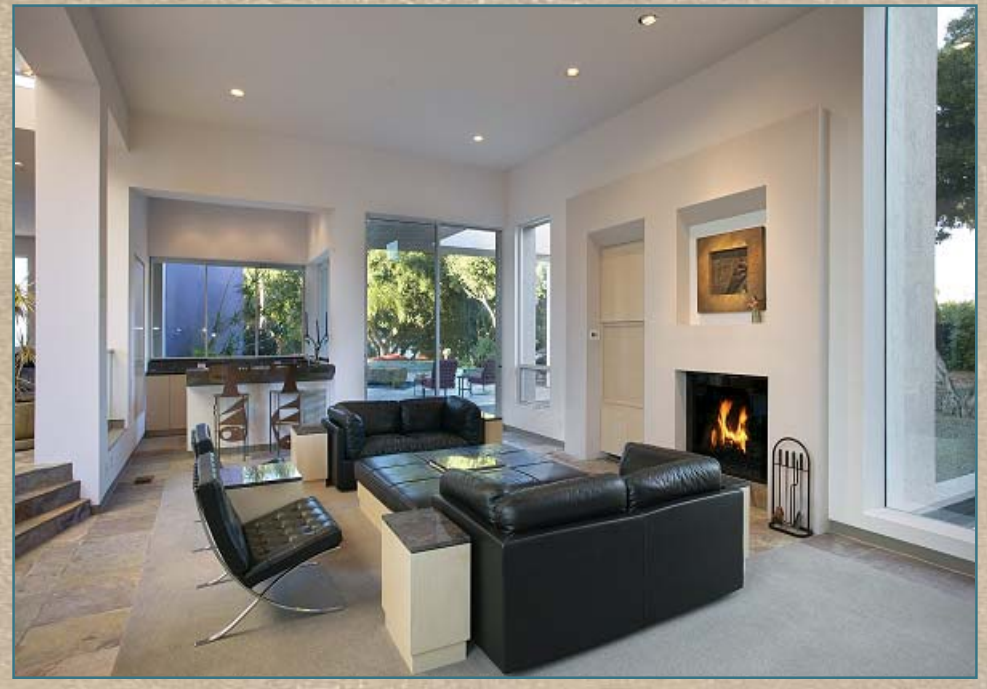
4464 VIA ALEGRE, HOPE RANCH SANTA BARBARA, CALIFORNIA